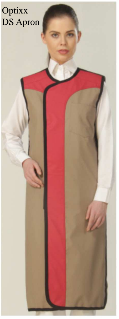
Optixx DS Apron